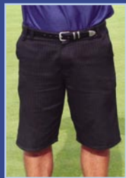
KNEE LENGTH TAILORED UP TO 5cm BELOW KNEE