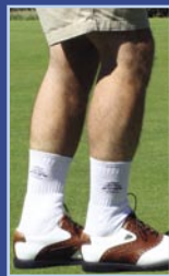
GOLF CLUB LOGO