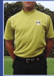
MOCK TURTLE NECK