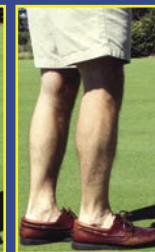
BOAT SHOES & NO SOCKS