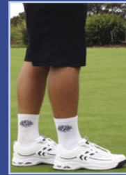
SPORT - GOLF SHOE