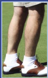
ANKLETTE - PLAIN WHITE