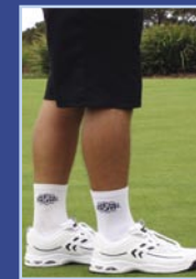
SPORT - GOLF SHOE