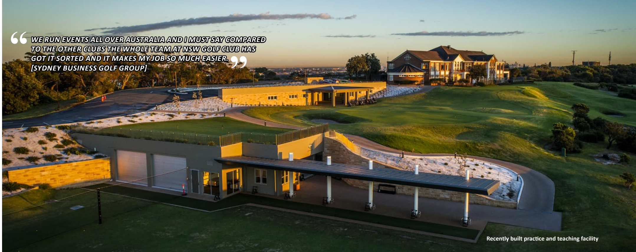
Recently built practice and teaching facility

“WE RUN EVENTS ALL OVER AUSTRALIA AND I MUST SAY COMPARED TO THE OTHER CLUBS THE WHOLE TEAM AT NSW GOLF CLUB HAS GOT IT SORTED AND IT MAKES MY JOB SO MUCH EASIER.” [SYDNEY BUSINESS GOLF GROUP]