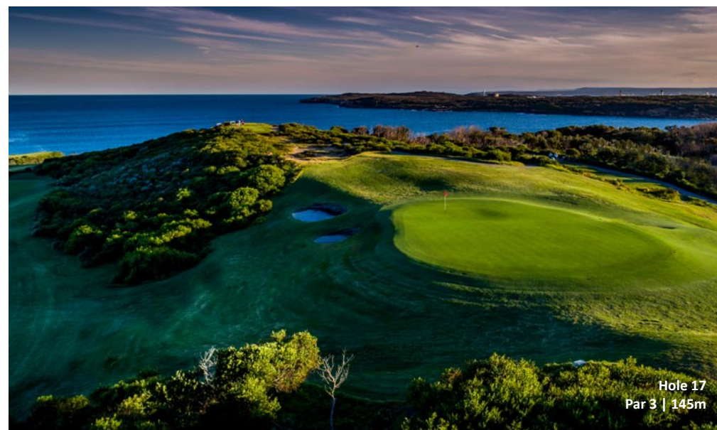
Hole 17 Par 3 | 145m

The New South Wales Golf Club looks forward to providing you and your guests with a most memorable golf and dining experience.