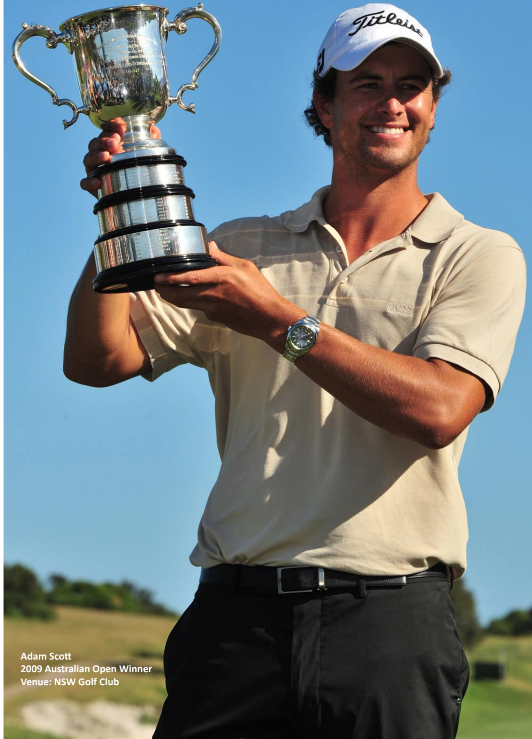
Adam Scott 2009 Australian Open Winner Venue: NSW Golf Club

The Clubhouse is a magnificent combination of traditional architecture and five star comfort. It features a dining room for up to 110 people, a number of lounge areas, central bar and conference room plus fabulous golfing facilities and a fully equipped golf shop.