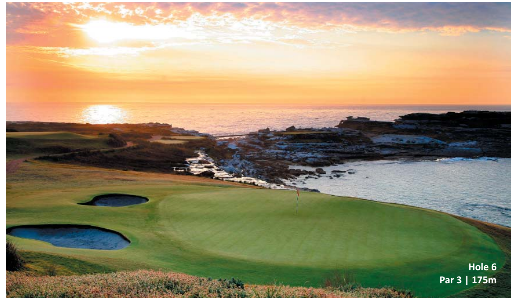
Hole 6 Par 3 | 175m

The New South Wales Golf Club looks forward to providing you and your guests with a most memorable golf and dining experience.