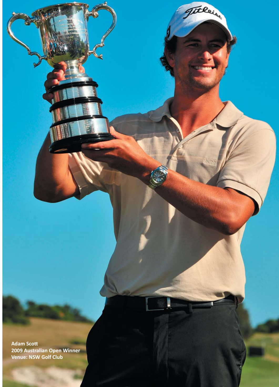
Adam Scott 2009 Australian Open Winner Venue: NSW Golf Club

The Clubhouse is a magnificent combination of traditional architecture and five star comfort. It features a dining room for up to 110 people, a number of lounge areas, central bar and conference room plus fabulous golfing facilities and a fully equipped golf shop.