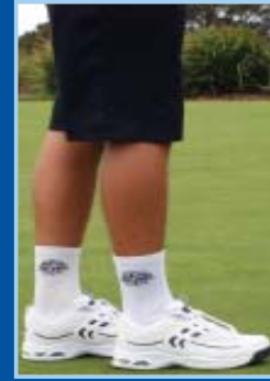
SPORT - GOLF SHOE