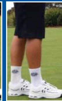
SPORT - GOLF SHOE