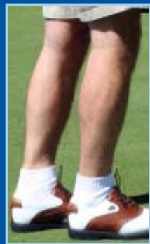
ANKLETTE - PLAIN WHITE