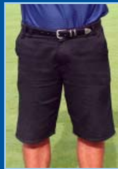
KNEE LENGTH TAILORED UP TO 5cm BELOW KNEE