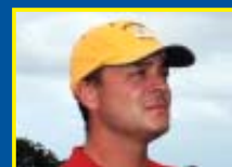
HAT / CAP