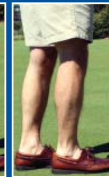
BOAT SHOES & NO SOCKS