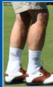
GOLF CLUB LOGO