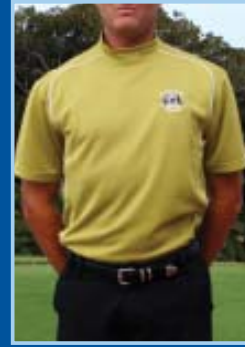
MOCK TURTLE NECK